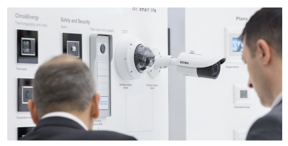
The combination of theoretical knowledge and practical applications is a living reality at Light + Building. This becomes clear in the security technology product segment, amongst others, and in the international platform for connected security technology, Intersec Building.

As a part of Light + Building, Intersec Building, with its international leaders in the security market, such as ABUS, Gretsch-Unitas, Hikvision and Mobotix, will be bridging the gaps between theoretical knowledge and practice. There will, moreover, be plenty of examples of integrated security technology in many of the other halls at Light + Building.