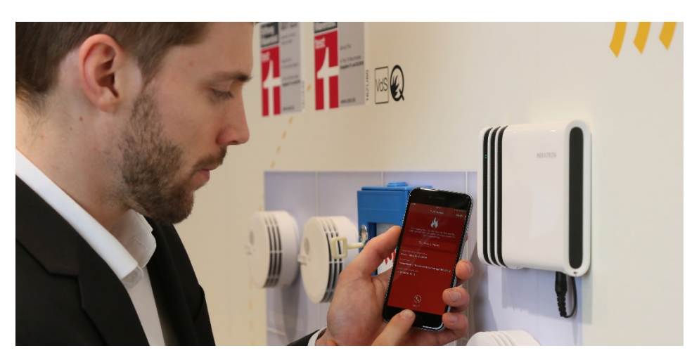
Digital infrastructure depends on connected security measures. The leading international trade fair for lighting and building services technology is devoting a guide, special promotions and floor space entirely to this topic.

It was only yesterday that thick-panelled doors, lockable window catches and steel-walled safes represented the current standard. Today, this is no longer enough. Not least, indeed, because things that need protecting are no longer just material items. Networks and data streams are non-material things, but are, nevertheless, in many instances, of inestimable value. Particularly when you attempt to calculate the maximum costs of losses, it becomes clear that security systems will, in future, also need to involve strategies for protecting digital infrastructures even more closely.