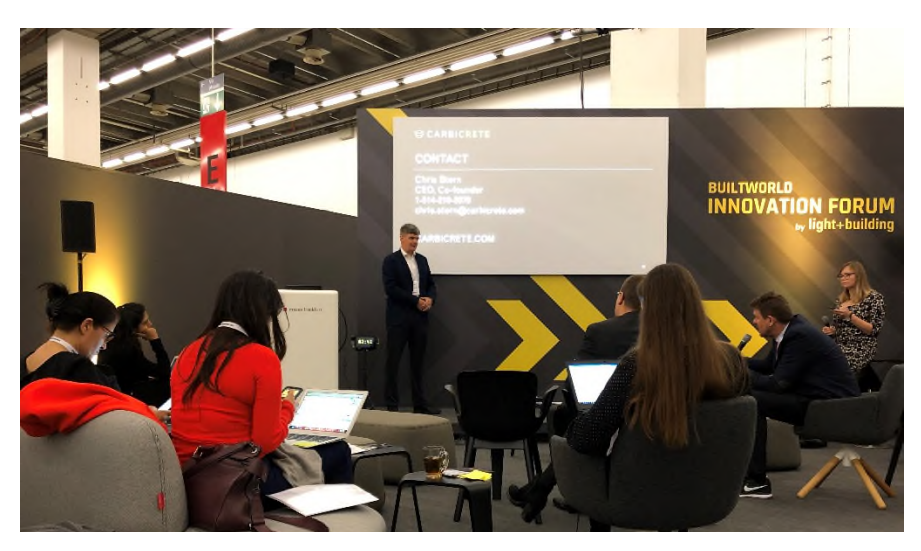
Builtworld Construction Innovation Contest: The two-day prepitch in hall 9.0 of Messe Frankfurt brought together jurors from the best-known established companies in the real estate and construction sectors as well as building technology.

The 25 finalists include ConTech startups and companies from America (Argentina, Canada, USA), Asia (Singapore), the Middle East (Israel), and Europe (Belgium, Germany, Great Britain, the Netherlands, Norway, Poland and Switzerland). Builtworld and its partner Messe Frankfurt will welcome them as fianlists and exhibitors in the Builtworld Innovation Forum by Light + Building 2020. In this way, innovative startups and technology companies will be able to present their solutions to more than 220,000 industry experts at Light + Building in Frankfurt am Main.