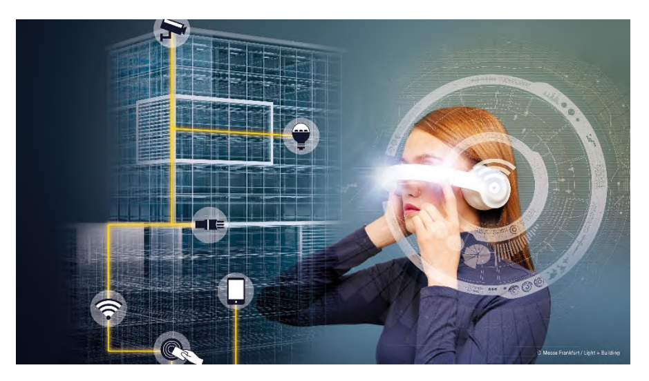
Light + Building 2020: Digital networks in buildings make new services possible

The idea is simple: in the last analysis, it is light not luminaires that customers want. Thus, via service agreements, they can obtain the best lighting for their premises without having to bear high investment costs. They not only profit from the reduced effort required but always have the latest technology and enjoy accounting benefits.