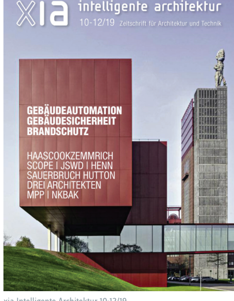
xia Intelligente Architektur 10-12/19