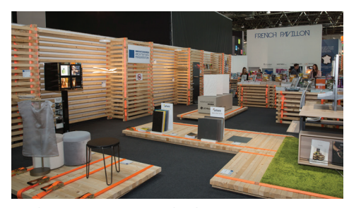
Stand system Innovation Award Architecture+ Presentation 2017

The Innovation Awards are addressed to companies and processing businesses as well as architects and interior designers working in these areas. Based on architectural criteria, they award products and conceptual solutions which equally impress by their design and technical aspects.